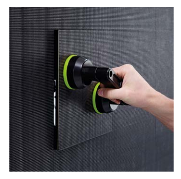
▲ The GEKKO is a specially designed tool enabling you to replace the LED modules at the front with ease. The control unit at the back also dismantles quickly thanks to two manual locks.