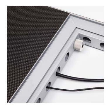
▲ The holes in the beMatrix frames also act as cable conduits and they connect together, meaning no more ugly cable spaghetti is visible at the rear of the stand.